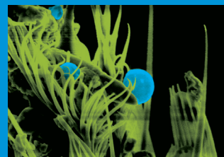
This magnified photo of Demand CS shows iCAP technology microcaps (in blue) on the leg of a mosquito.